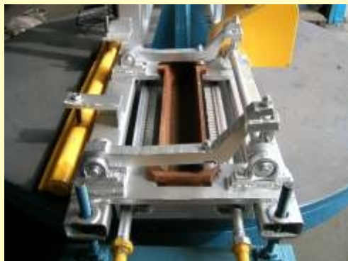
Unique granule knock-out system

Additional equipment not included but supplied if required: Safety platforms and walkways, mould-making equipment and bin collection equipment