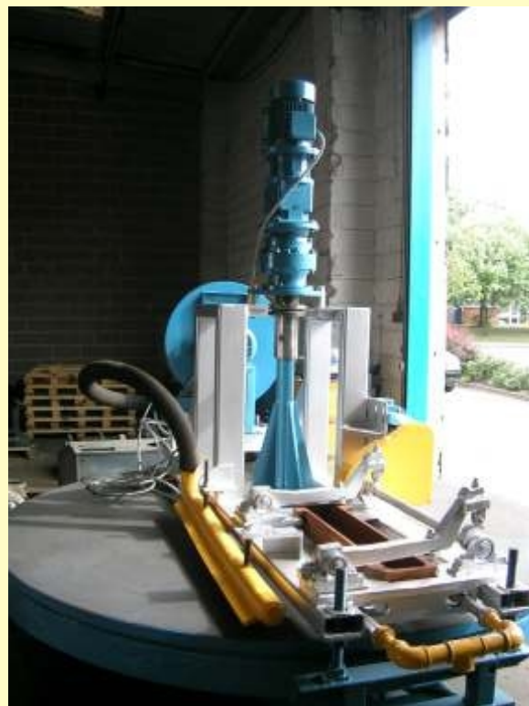
Single table system